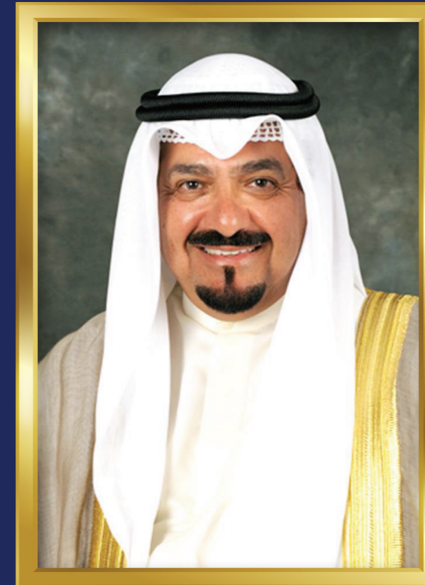
His Highness Sheikh Ahmad Al-Abdullah Al-Ahmad Al-Sabah The Prime Minister of the State of Kuwait, May Allah protect him