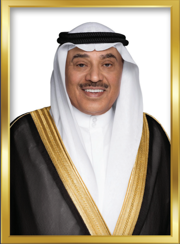
His Highness Sheikh Sabah Al-Khaled Al-Hamad Al-Mubarak Al-Sabah The Crown Prince of the State of Kuwait, May Allah protect him