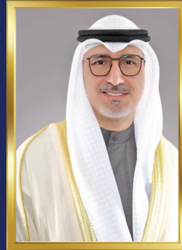
His Excellency the Minister of Commerce and Industry and Chairman of the Board of Directors of the Public Authority for Industry Khalifa Abdullah Al-Ajeel