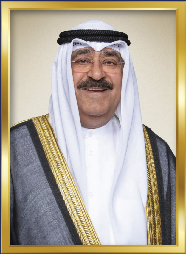
His Highness Sheikh Mishal Al-Ahmad Al-Jaber Al-Sabah The Amir of the State of Kuwait, May Allah protect him